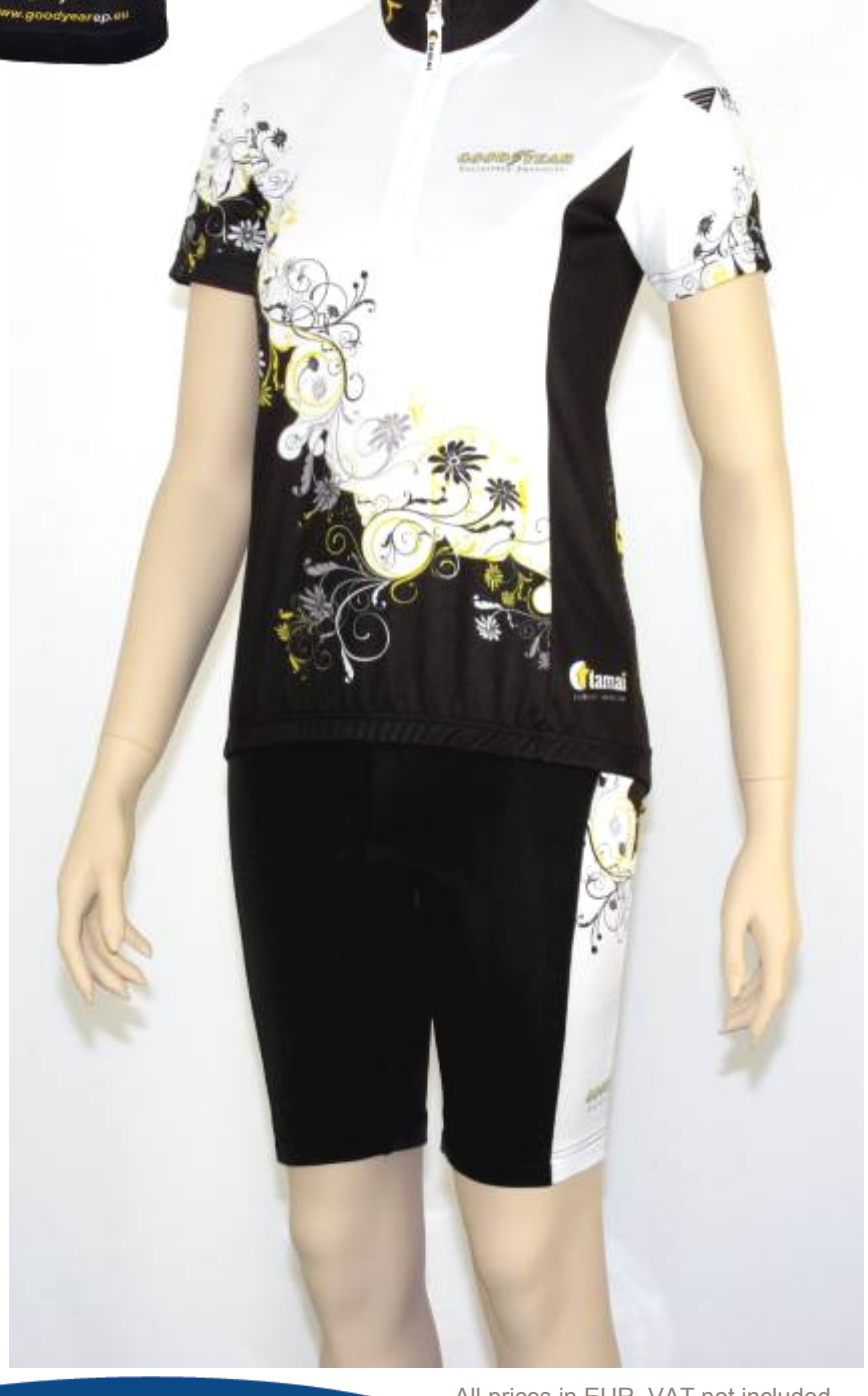
All prices in EUR, VAT not included.

Article No: S - 20490111 | M − 20490112 | L - 20490113 | XL − 20490114 | Min. ordering quantity: 1 pcs | \in 62,10 |