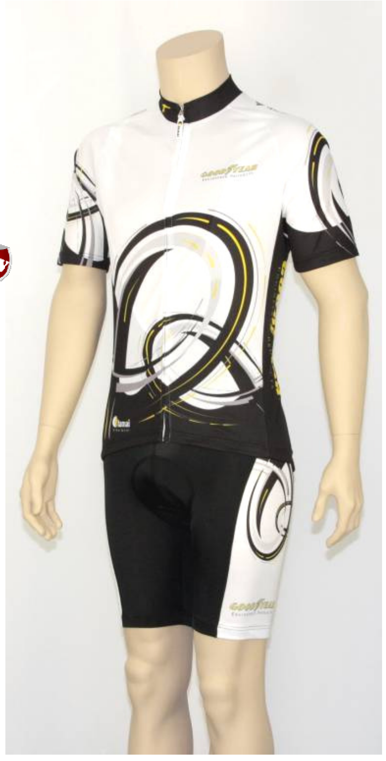
All prices in EUR, VAT not included.

Article No: S - 20490106 | M - 20490107 | L - 20490108 | XL - 20490109 | XXL - 20490110 | Min. ordering quantity: 1 pcs | € 68,00 |