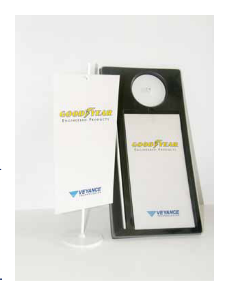
TABLE TOP FLAG

Article No: 20147468 | Min. ordering quantity: 1 pcs | € 68,54 |