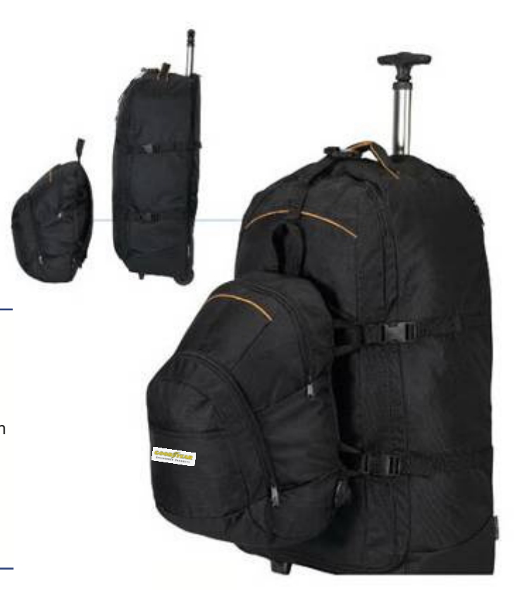
All prices in EUR, VAT not included.

Article No: 20288868 | Min. ordering quantity: 1 pcs | € 53,29 |